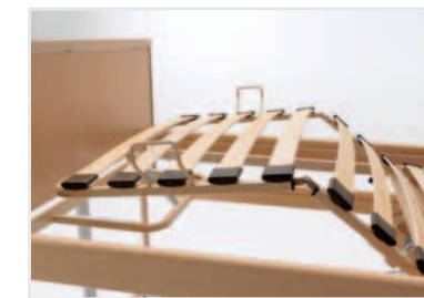
lower leg rest liftable by Rastomat (later mounting of Rastomat also possible)