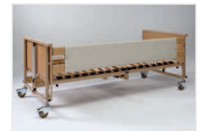
leather foam covering