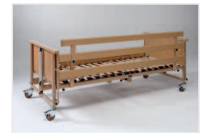
add-on safety frame rail