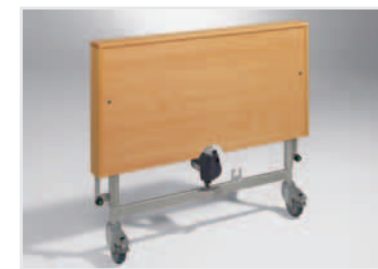
wooden filling for the covering of the chassis (also for later mounting)